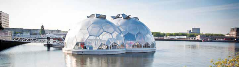
Floating Pavilion in Rotterdam.

Public Sector research institutions in the Netherlands consist of 14 universities, 18 KNAW Institutes<sup>1</sup>, 6 Netherlands Organization of Scientific Research (NWO) Institutes, 5 Large Technological Institutes (GTIs)<sup>2</sup>, 14 TNO<sup>3</sup> Institutes, and a number of other state owned research and advisory centres. All Dutch universities are ranked in the top 200 of Times Higher Education Rankings. Together, these universities and institutes form the backbone of the research and innovation landscape in the country.