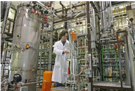
A specialist scales up the production of new treatments in the microbial fermentation pilot plant.

In an effort to improve health outcomes for Canadians affected by diseases such as cancer and Alzheimer's, the National Research Council of Canada is announcing three research programs to help industry get new medicines on the market faster.