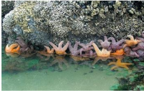
Intertidal community at low tide in Yachats Bay, Oregon. The picture shows seastars ( Pisaster ochraceus ), which are keystone predators, climbing out of a tidepool and onto the side of a large rock in order to reach and feed on their preferred prey, namely barnacles (grey) and mussels (blue).