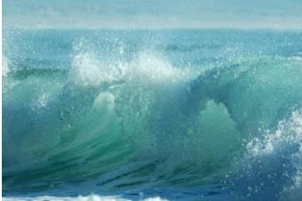
The JRC's MSFD Competence Centre aims to help Member States achieve Good Environment Status of European seas

The JRC has set up the MSFD Competence Centre (MCC) to help EU countries achieve 'Good Environmental Status' of their marine waters by 2020, the main aim of the Marine Strategy Framework Directive (MSFD) . In achieving this aim, the MSFD seeks to protect the fragile balance of marine ecosystems, upon which many economic and social activities such as fishing or tourism depend.