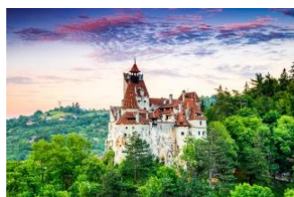
Bran Castle, also known as Dracula's castle

The coordination of EURAXESS Romania is ensured by UEFISCDI and The Ministry of Research, Innovation and Digitisation. The EURAXESS network in Romania has nine support centres : Banat University of Agricultural Sciences and Veterinary Medicine, Timisoara; Institute for Macromolecular Chemistry 'Petru Poni' Las; Lucian-Blaga-University of Sibiu; Bucharest University of Economic Studies; University of Bucharest; 'Gheorghe Dima' Music Academy; Valahia University Targoviste; North-West Regional Development Agency, Cluj-Napoca; and Chamber of Commerce and Industry Brasov.