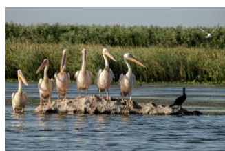
7 Romania Danube Delta