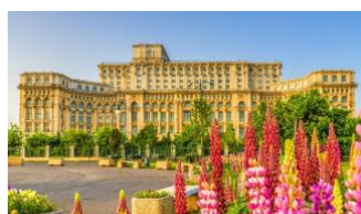
The Palace of the Parliament Bucharest