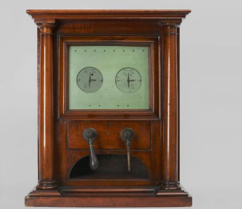
Cooke and Wheatstone Dual-Needle Telegraph

At the House of European History, a European story is being told by way of objects, documents, and audio-visual testimonies from across Europe and beyond. Hundreds of artefacts of various origins have been brought together in one physical space in Brussels, and are progressively featured online as well. Discover now one of these objects and its historical significance on the House of European History's online collection page: the <u>Cooke and Wheatstone Dual-Needle Telegraph</u> is an exceptional testimony of the ingenuity of Europeans in the late 1850s, demonstrating how undersea telegraph lines would allow for truly global communication. Learn more <u>here</u>.